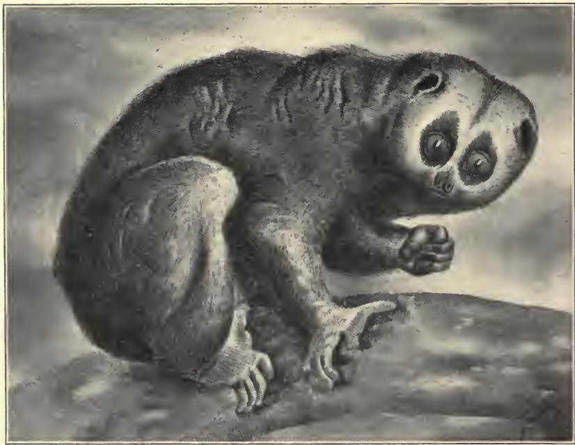
FIG. LXXVIII. NYCTICEBUS COUCANG. SLOW LORIS.

Nycticebus cinereus A. Milne-Edw., Nouv. Arch. Mus. Bull., III, 1867, p. 11.